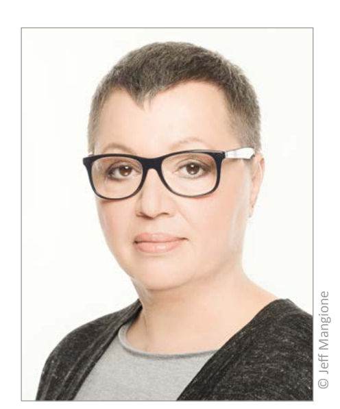
Dr. Sabine Oberhauser, MAS Austrian Federal Minister of Health

The reasons why people start to abuse psychoactive substances and develop addiction are complex. Both personal factors and one's environment play a significant role here. The examples of drinking, smoking, use of medications, as well as gambling, illustrate that it is not only in the case